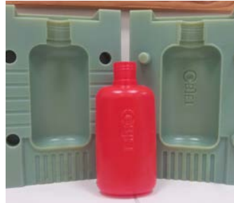
A blow molded bottle created with a PolyJet mold is ready to be reviewed for form and function.

PolyJet 3D printing builds plastic objects layer-by-layer, using data from computer-aided design (CAD) files. Combined with the properties of PolyJet materials, it can create high-resolution, smooth surfaces which are ideal for short-run blow molding applications like prototype evaluation and low-volume manufacturing. What's more, the finished parts have the appearance and function of those from a production run. PolyJet blow molds, when used in conjunction with machined injection molds for preforms, will even produce clear bottles in PET on IBM process machines.