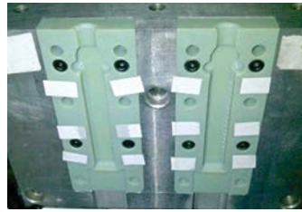
Digital ABS cavity inserts in a mold base.

Using the prototype packages, Plasel was able to confirm that the new design performed perfectly on the automated conveyance line, while also validating its form, fit and function.