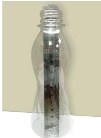
Clear PET bottle produced using a PolyJet mold.