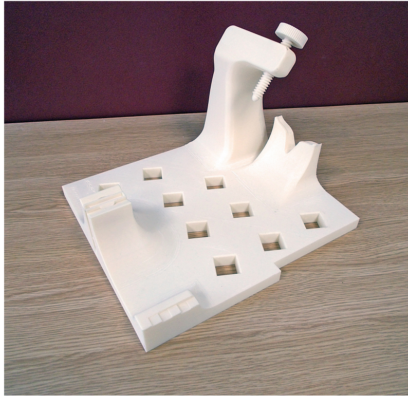
Moog produces a dedicated CMM fixture for every machined component produced on-site at Wolverhampton.

Moog reviewed many options during the evaluation phase and chose the Stratasys Fortus 3D Printer because it met all the required technical standards. "The FDM process of the Fortus produced a more stable part through the sampling process," said Stuart-Young. "Furthermore, the build envelope and printing materials satisfied our needs, and the price was within our budget."