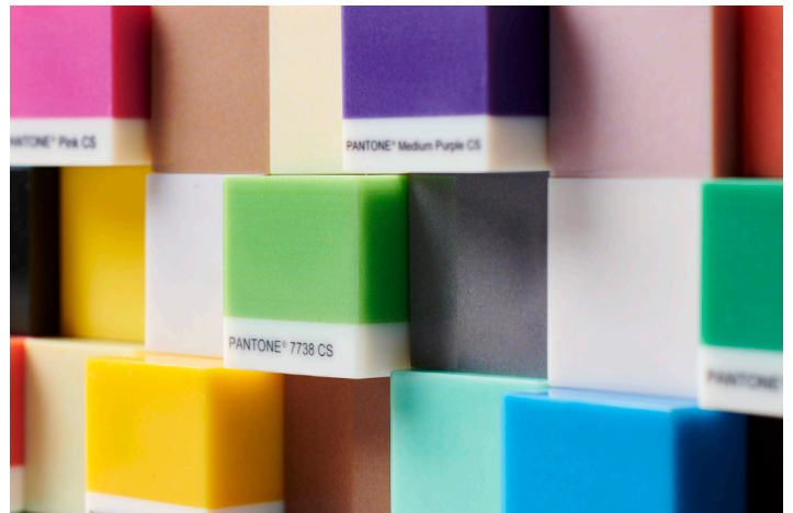
Pantone color blocks