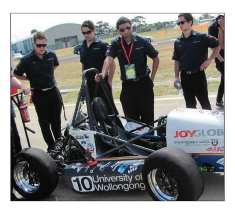
Finished race car with student team.

"3D printing had definitely helped us sharpen our competitive edge," concludes Tarlinton.