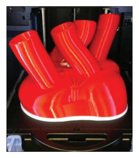
Manifold on 3D printer.