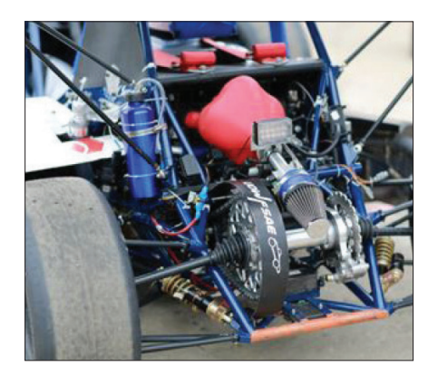
3D printed manifold installed on car.