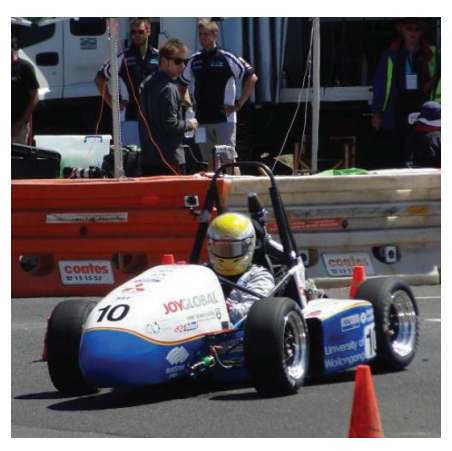
Race car on course.