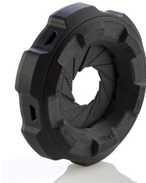
The soluble support capability of Stratasys F123 Printers made it possible to prototype this camera lens cover with an adjustable aperture.

Consumer 3D printers may seem like an attractive RP solution because they're often compact and very affordable. They offer a low barrier of entry to inexpensive, in-house rapid prototyping capability and intellectual property security. While it's an appealing strategy, it's not without risk. Yielding to the seduction of low-priced equipment will often limit your long-term prototyping capabilities, growth plans and day-to-day equipment uptime.