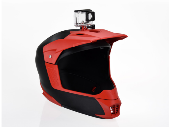
This motocross helmet and the attached red accessories were prototyped and 3D printed using the Stratasys F370 3D Printer.

However, embracing this technology or broadening its use, is often avoided for a number of legitimate reasons. Investing in professional 3D printers can pose a significant financial hurdle and companies find it difficult to justify the cost, especially for small to midsize companies. Many types of additive manufacturing require comprehensive knowledge of the process and equipment. That typically means hiring new employees, increasing the payroll.