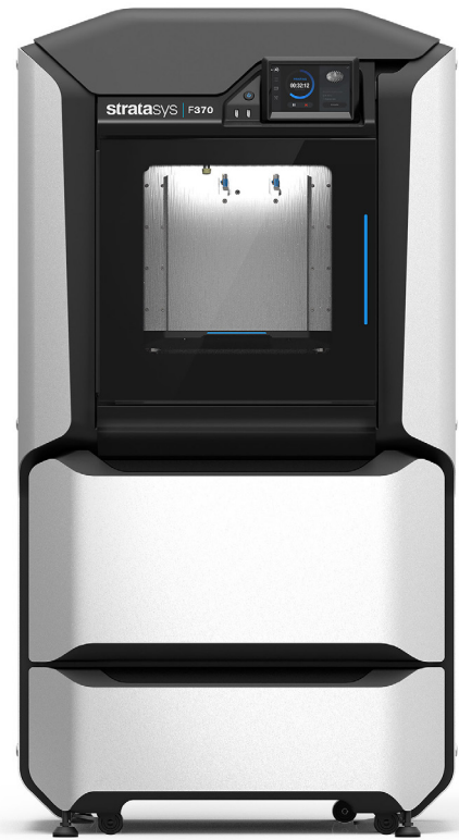
The Stratasys F370™ 3D Printer.

It's no secret that businesses need to quickly respond to changing customer and market demand to stay competitive. Getting a new product out before your competition helps you generate new revenue and maintain market leadership. But doing that is not easy, particularly