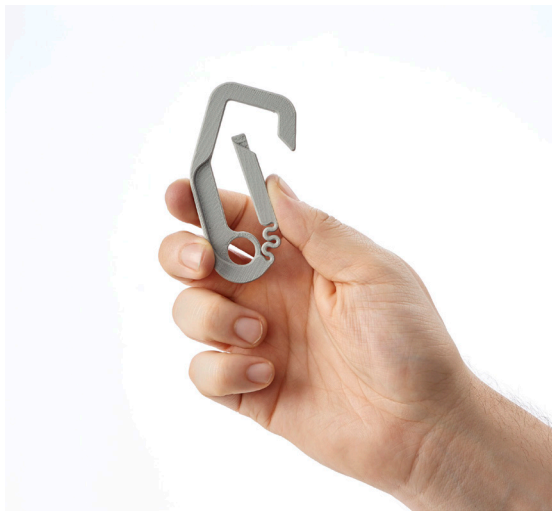
This prototype carabiner design has a flexible living hinge made possible with Stratasys F123 Printer engineering plastics.

built in an enclosed, insulated build chamber with an auto-locking door for safe operation and no risk of outside physical interference. Noise insulation provides exceptionally quiet operation, under 46 decibels, which is similar to a residential refrigerator.