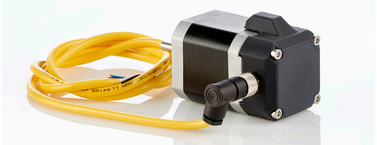
The end cap on this stepper motor was 3D printed to perform functional tests for proper fit.