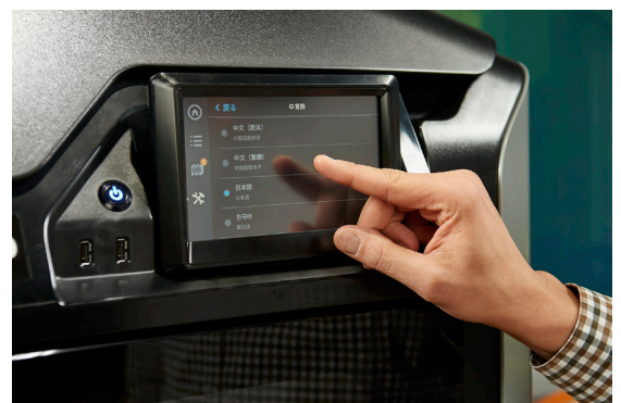
The Stratasys F123 3D Printer touch screen with multi-language display.

Stratasys F123 3D Printers offer multiple features that increase a workgroup's productivity. GrabCAD Print software enables print queue and multi-tray