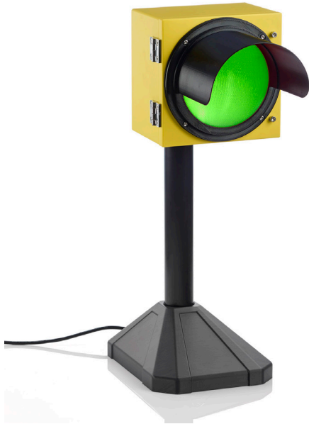
Engineers went from concept to fully functional prototype for this traffic signal that incorporates UV-resistant ASA material.

GrabCAD Print™ software makes the task of printing parts easy too. It's formatted similar to CAD software, which is familiar to designers and engineers. Once parts are designed, the engineer simply hits the "print" command to print the parts.