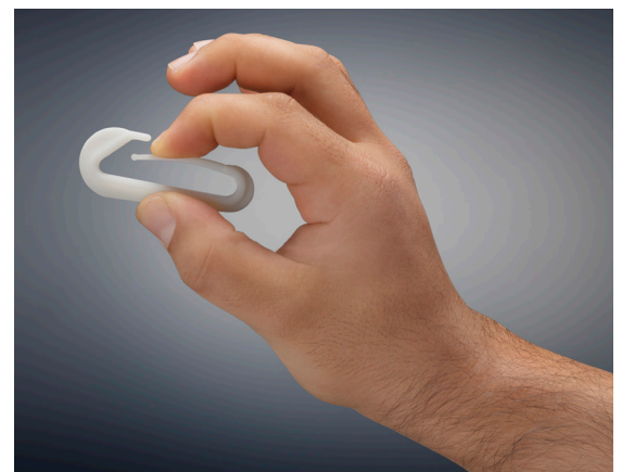
Figure 3. Rigur material was engineered for prototyping polypropylene products.

Durus is the original Stratasys offering for prototyping semi-rigid polypropylene products that can withstand contact forces and give when pulled. Durus is a milky white color.