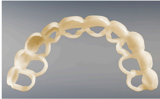
Figure 5. VeroGlaze produces functional dental veneer try-ins.

Property-wise, these materials are nearly identical to Rigid Opaque. The one exception is stiffness, which is nearly 50 percent greater, so these materials are strong and very rigid.