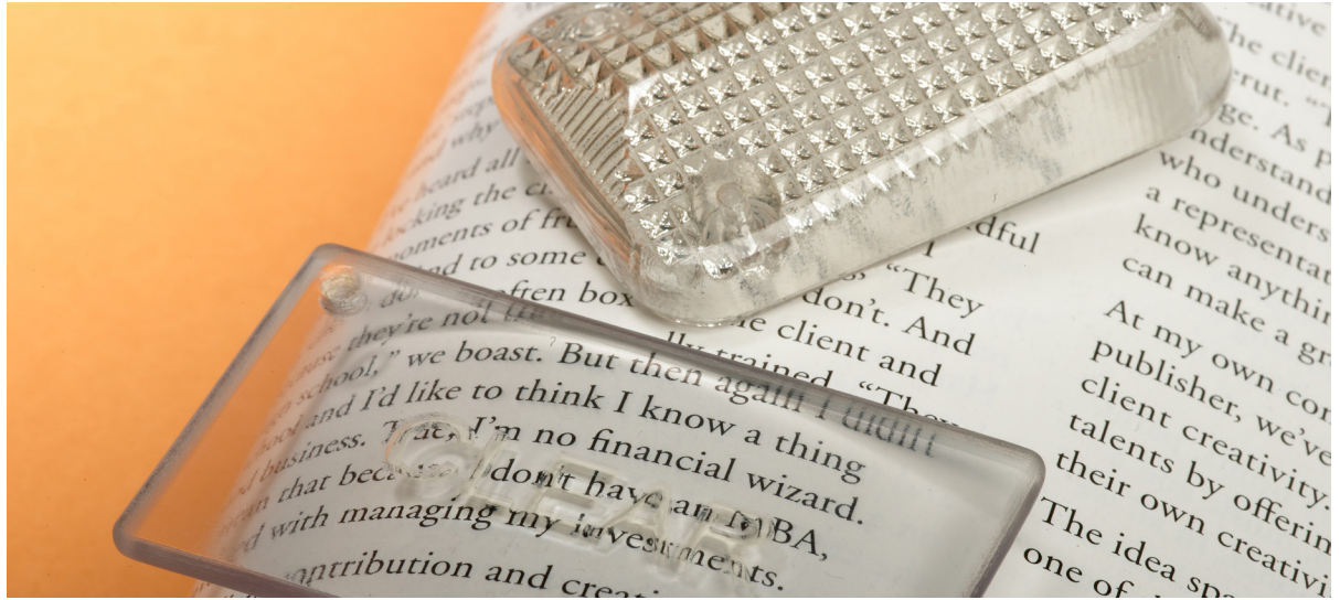
Figure 2. VeroClear produced these lenses.