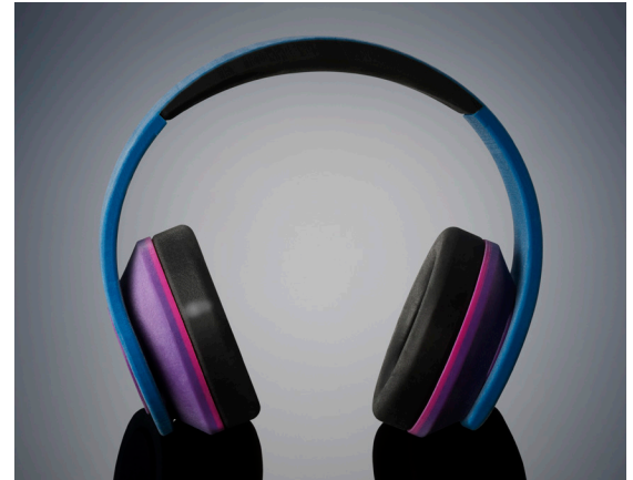
Figure 4. The rubber pads on these headphones have a soft Shore A value of 27. The full model was 3D printed in one piece.

Applications include rubber surrounds, overmoldings, buttons, knobs, grips, gaskets and boot and hose assemblies. PolyJet rubber material is also used for prototyping outsoles for footwear.