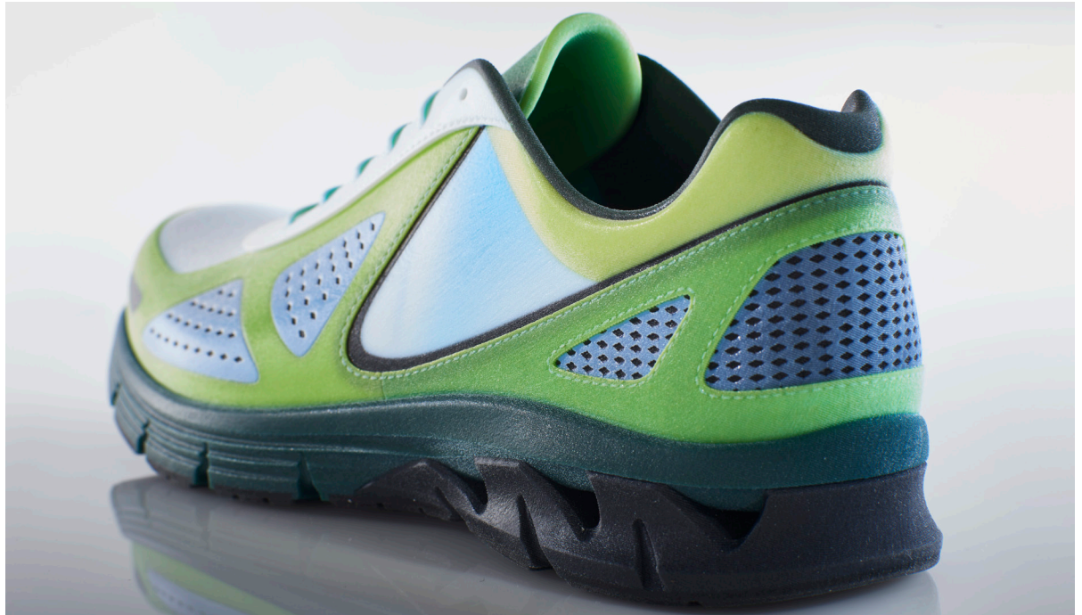
Figure 1. This full-color multi-material athletic shoe was 3D printed in one piece and represents a range of Shore A values.

photopolymers are also REACH-compliant and environmentally safe.