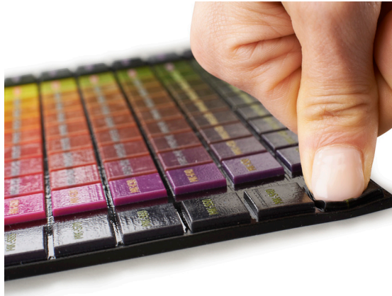
Figure 8. Various colors and Shore A values are displayed on this palette.

dramatically, from soft-touch with subtle color to decidedly un-rubber-like materials that offer 10 Shore A hardness values ranging from 35 to 100. Counting the options for color, there are hundreds of digital material options for rubber.