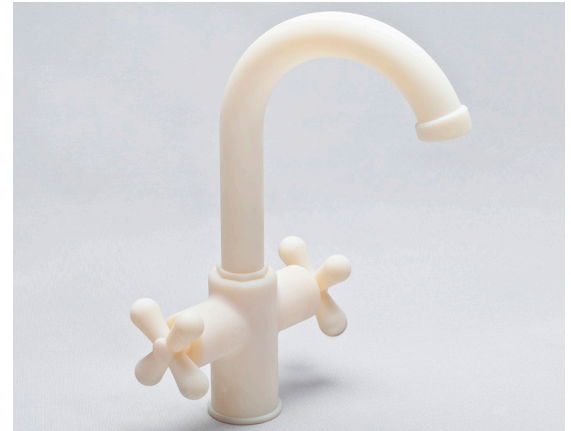
Figure 6. High Temperature material can withstand hot fluids.

As its name indicates, this material is for applications that have elevated temperatures. Straight from the 3D printer, High Temperature material has up to a 55°F higher heat deflection temperature (HDT) than any other PolyJet base resin. With an optional thermal post cure, HDT climbs to 80°C (176°F), which is close to that of an average ABS¹.